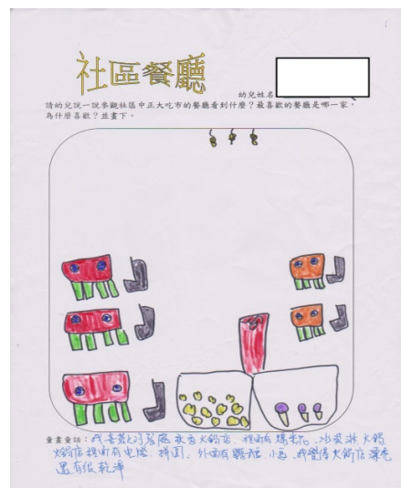
Figure 2. Ying's Worksheet

We first introduced the shop signs, and then the street views... We talked about the signboard, entrance, and equipment in the restaurant... And the children found that... “Teacher, this shop is all blue. That shop is all green. The restaurant is blue and the drink shop is green.” The children perceived the features of different restaurants. (Interview I, 04/24/2015)