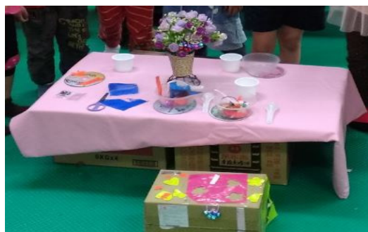
Figure 4. The Children’s Table, Chairs, and Decorations

In the concluding activity, the children invited their parents and the principal to enjoy their food and drinks in their restaurants on the display day. The children were divided into three groups, one for each restaurant, a hot pot restaurant, a coffee restaurant, and a café. Each group played the roles of restaurant owner, cashier, waiter or waitress, and cook. They also presented music performances with singing and dancing at the opening ceremony.