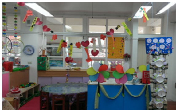
Figure 3. Decorations in the Children's Restaurant

Performing and creating. The aesthetic ability of “performing and creating” means that young children apply various forms of art media and imagination to perform and create artworks (MOE, 2012). In this study, the children applied a variety of materials to construct their three ‘restaurants’ by making signboards, tables, chairs, paintings, decorations, menus, food and drinks, and music (Figure 3). They then performed a role play with the props and equipment in their restaurant learning area, as well as music performances at the opening ceremony of their model restaurants.